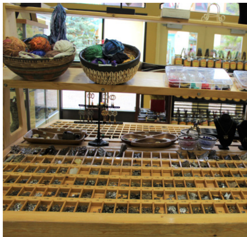
Bead Haven has many different styles of beads, pendants, brass filigree and unique clasps, so customers can choose their own supplies to create custom-made jewelry.