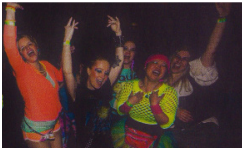
Festival-goers can dress up and see bands perform popular '80s hit songs at the two-day '80s Fest on April 26-27. PHOTO / STAFF